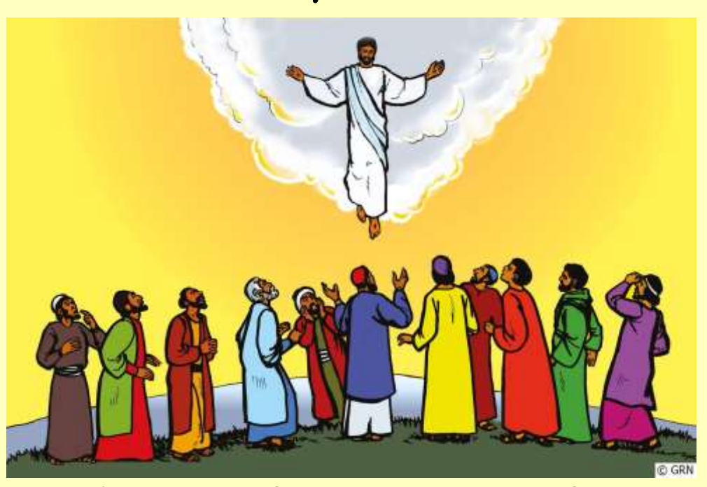
The return of Jesus to Heaven after God raised Him from death.