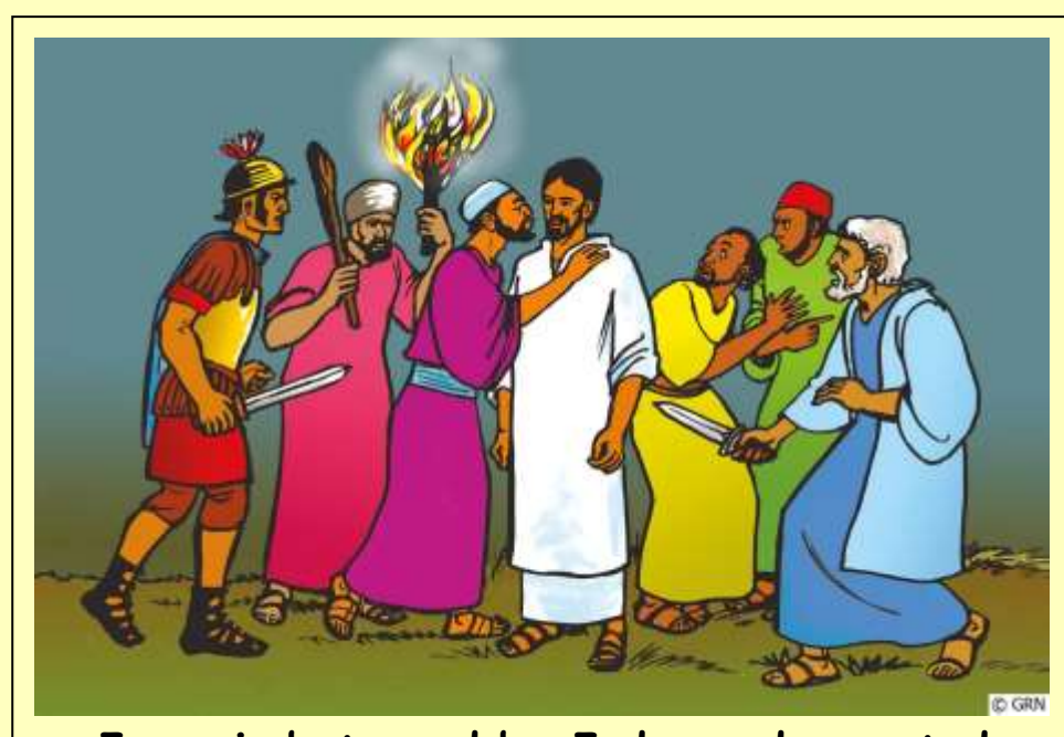
Jesus is betrayed by Judas and arrested

Jesus said, "Do you have to come out with swords and clubs to capture Me? Every day I taught in the Temple courts and you did not arrest Me. But the Scriptures must come true", Jesus said.