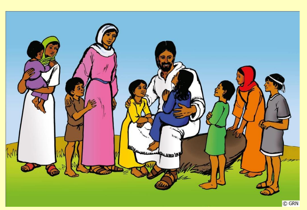
Jesus blesses the children