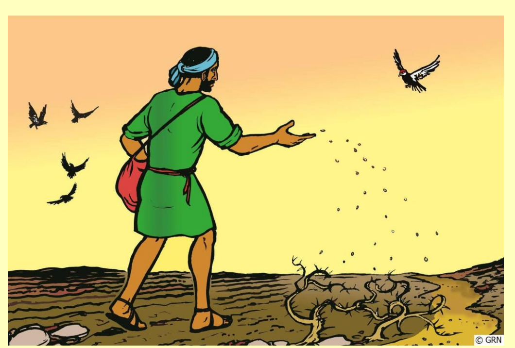
Jesus and the parable of the sower