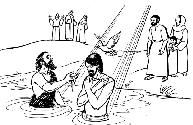
Jesus is baptised